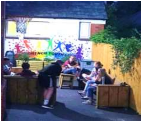
Their new 'external room'.